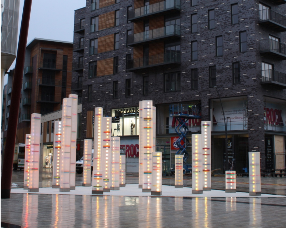
Figure 2 Strata. Bury, Greater Manchester. Interactive LEDs inside polycarbonate triangular prisms. There are sensors located at ankle level so that as people walk through the lights, they trigger a pattern of color behind them.