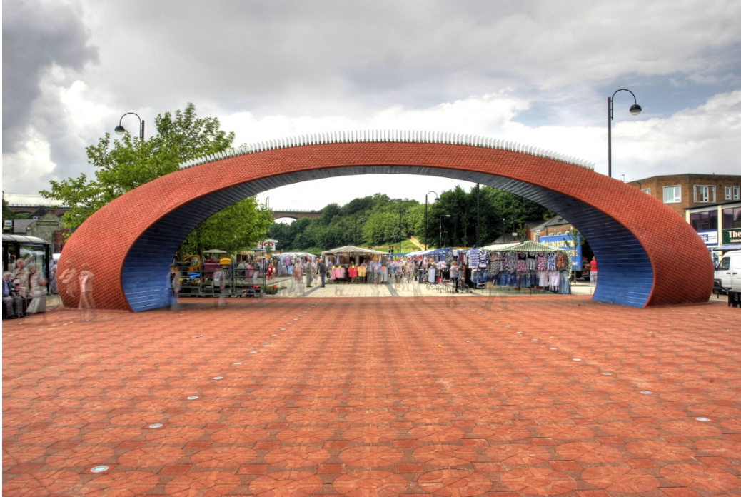
Figure 4 Chester le Street Arch. A brick arch entrance to the Market Place. The shape is inspired by the arches of the viaduct seen in the background. Made from bespoke bricks and a comb of polycarbonate tubes and programmed LEDs so that the top of the arch slowly changes color throughout the night. The Floorscape has inlaid lights programmed to slowly ripple blue along its length referencing the river which is buried along this axis.

In 2021 I decided to concentrate fully on my sculptural and technological combination focusing on the primal brain using a 3D printer.