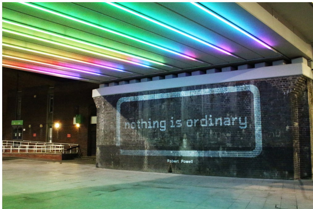
Figure 1 - Line of Light. Nottingham Railway Station. LED strips are connected to a sensor on the platform of the railway station above. As trains arrive and depart, the LED's change pattern. A different short poem is programmed to be projected each night.

Since 1999 I have financed myself by making sculptural artworks in the public realm mainly from light, again trying to dovetail the magic of technology with the human spirit.