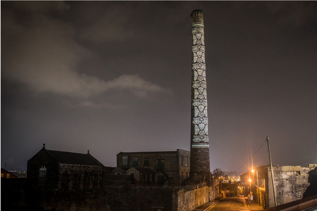
Figure 3 Chimney, Burnley. 3 spotlights and gobos make a pattern inspired by cotton printing wooden blocks for the chimney at ‘Weavers Triangle’, once the cotton producing capital of the world.