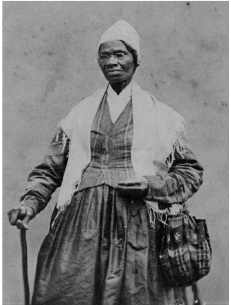
Figure 28 Sojourner Truth