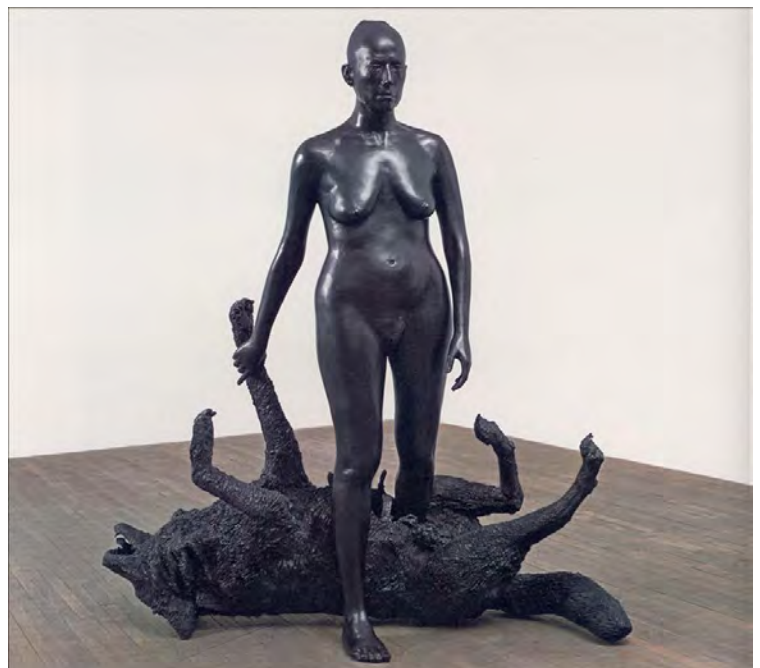
Figure 17 Rapture

Through this continual shaping and reshaping of her experience, and immersing herself for a time in the realm of wild, instinctual, animal life in a kind of internal, meditative, incubating activity, she eventually emerged into herself as a woman and as an artist. (ibid.) This new birth was sometimes portrayed as a composite being, like the wolf girl Smith imagines