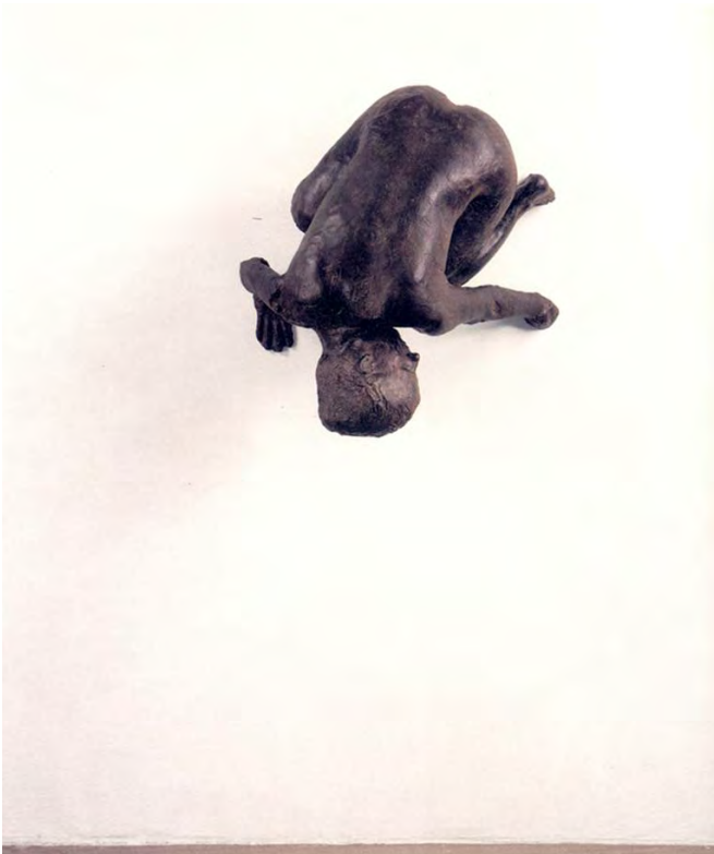
Figure 20 Lilith