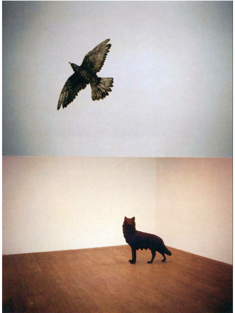
Figure 5 Bird/Wolf

In contrast to the playful attraction, desire and interpenetration Mary Oliver describes between spirit and body, the dictionary defines spirit and body in strict opposition to each other. Spirit is defined as "the non-physical part of a person that is the seat of intangible emotions, consciousness and character." (American Heritage, p. 1737) The word spirit comes from the Latin "spirare", meaning to breathe – so spirit, like breath, is the vital principle and animating force within living beings – and, also like breath, the spirit or soul is said to separate and depart from the body at death and may reappear as an apparition