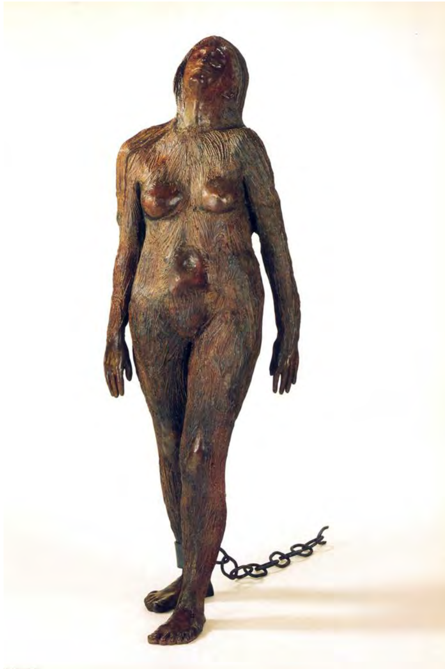
Figure 24 Mary Magdalene