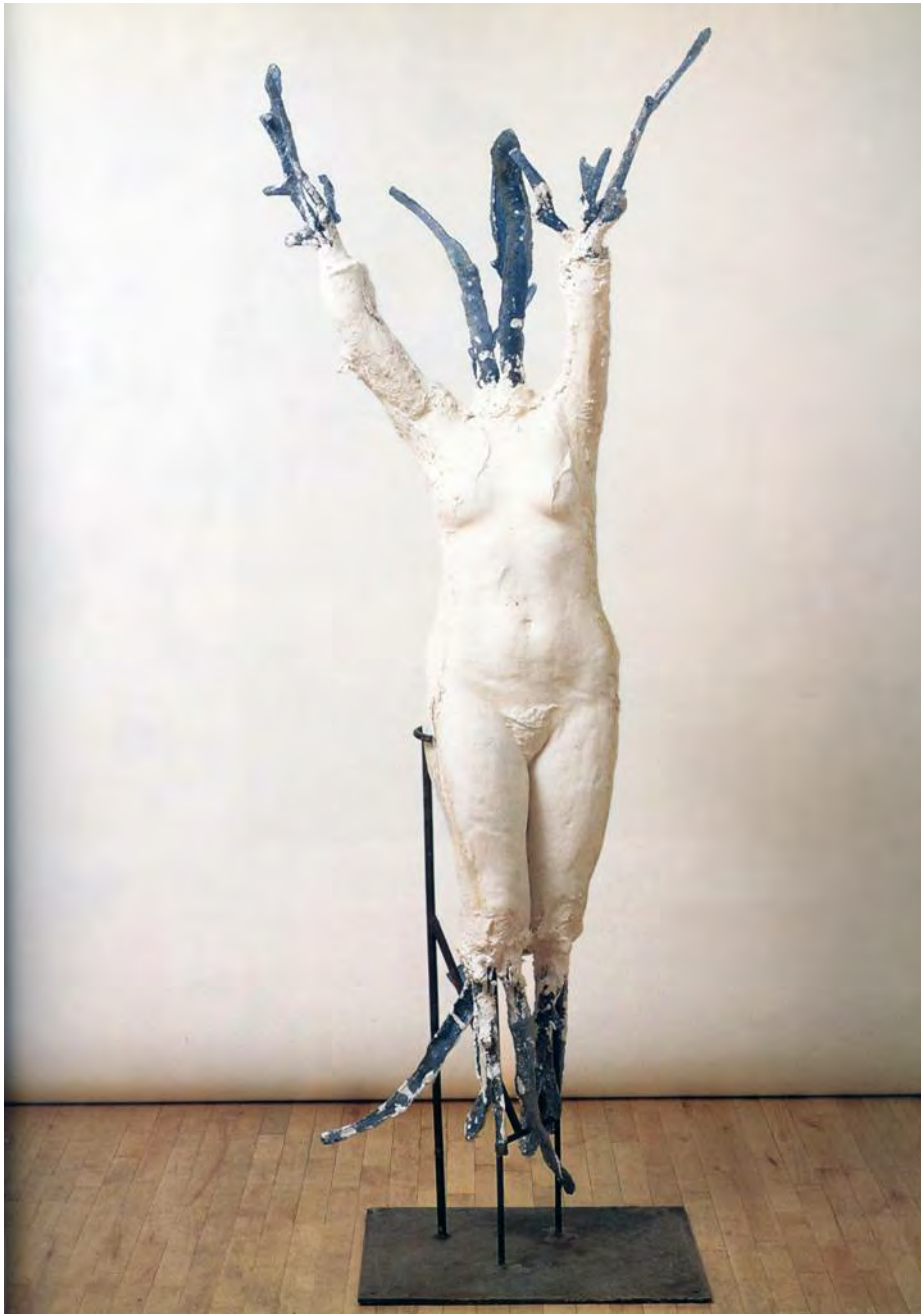
Figure 19 Daphne

Daphne refused rape by the god Apollo by turning herself into a tree. (Engberg, p. 45)