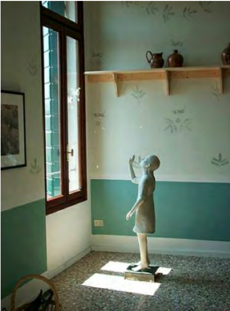
Figure 27 Homespun Tales

This re-imagining of the feminine figures of myth, religion and fairy tale leads Smith eventually into the historical and domestic realms, where the lives of girls and women are carried out invisibly and silently. (Engberg, p. 40) Beginning in Venice, with a show called "Homespun Tales", loosely based on domesticity and the idea of an American "squatting" in a Venetian palazzo, she reinvents the notion of domestic life, and re-imagines it as a highly creative realm where one dreams up and invents one's own future being. (Hentschel, p. 6) This show traveled and evolved into a show in Germany called "Her Home", and culminated in