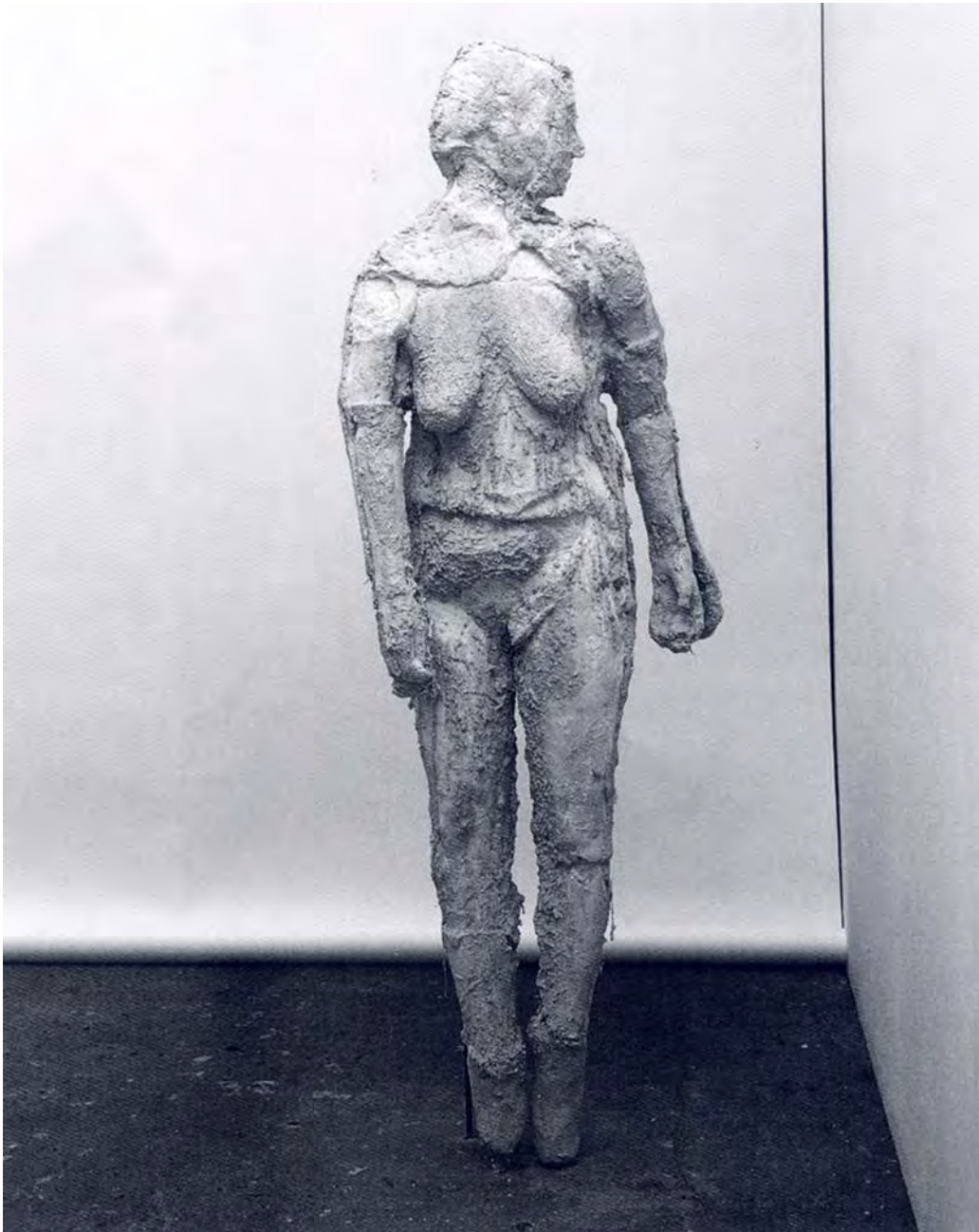
Figure 23 Lot's wife