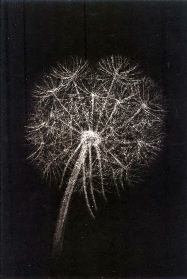
Figure 44 Dandelion