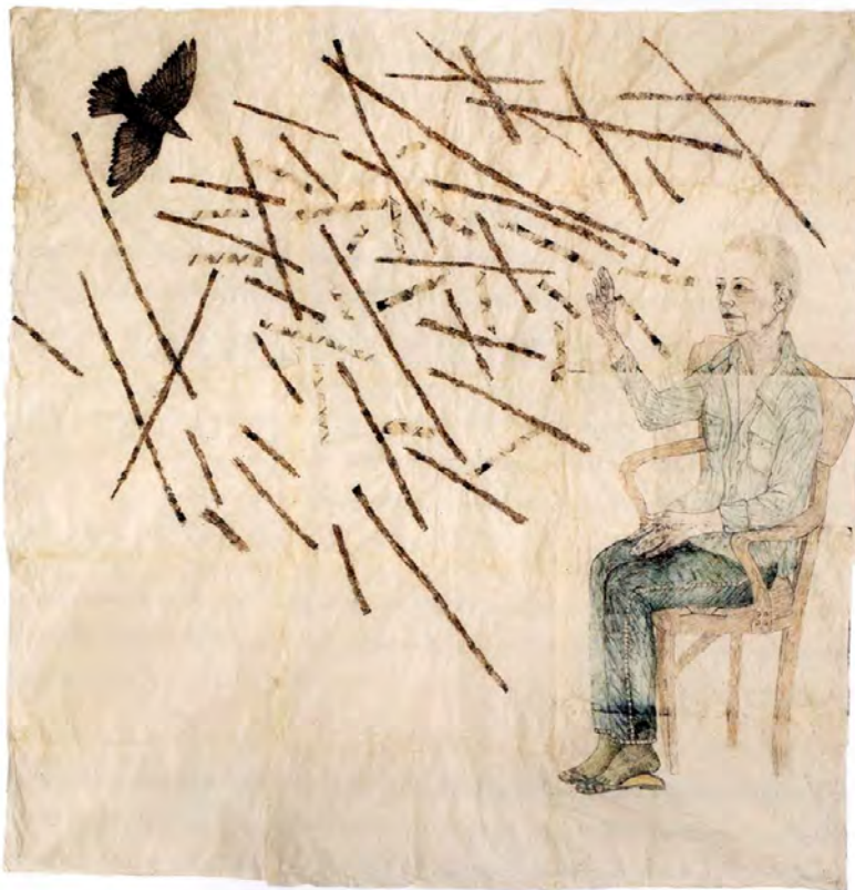
Figure 6 Visitation I

This defining diametrical opposition between spirit and body forms a seeming membrane or boundary, which separates as well as links them, so they are continually splitting apart and seeking ways come together again, whether in love or enmity, inspiration or possession. For the alchemists, the secret of the work was to "join the toad of the earth to the flying eagle". (Stolcius, pl. 20) The eagle is winged and fugitive, flies to the sky and receives the rays of the sun, while the toad stays close to the moist heavy earth. Jung quotes the alchemist Michael Maier: "Were it not