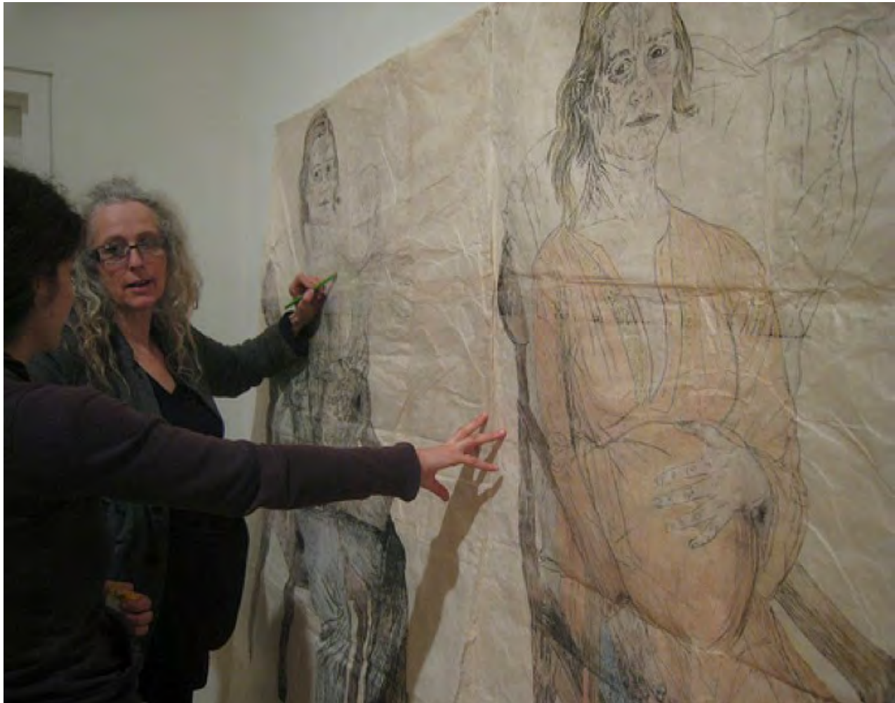
Figure 33 Quickening

with a similar notion in a paper scroll on the wall, which says “A something overtakes the mind; we do not hear it coming....”