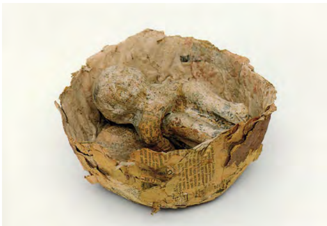
Figure 15 Fetus

While early in her life she imagined herself unborn, or stillborn, Smith says that she made artwork to save her own life, and to prove that she was indeed alive. (Engberg, p. 51) The split between body and spirit is continually being revisited, explored and reconciled in Smith’s art. The trajectory of her work, beginning with dismembered body parts, which are tenderly