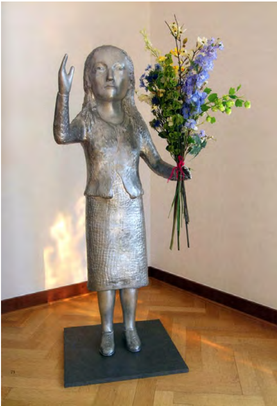
Figure 37 Singer

to be participatory, is led by the hand movements of the lead voice, setting the pitch and time while the group of singers follows along. This figure with her participatory action brings us full-circle to that ideal of joint creative work that Smith sees as realized in the process of collaboration with other artists, which has always been of great value to her, and also recalls the blithe, playfully intent, absorbed singing of her youthful self. (ibid., p. 27)