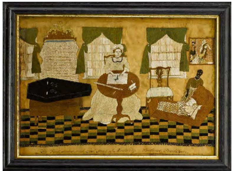
Figure 30 Prudence Punderson needlepoint

The centerpiece of the show, which serves as an orienting as well as a jumping off point, is the needlepoint of Prudence Punderson called “The First, Second and Last Scene of Mortality”. It depicts a woman’s journey from birth through death, cradle to coffin, both of which seem to circle around the central image, of a woman seated alone at a