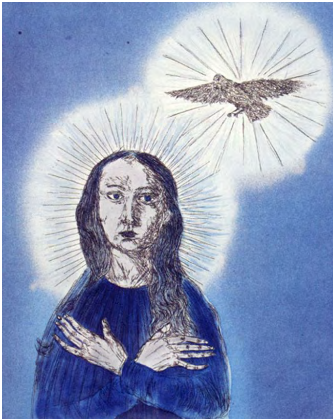
Figure 32 Virgin with Dove

pers, extends her hand in a gesture of wonder toward a gold-leafed aluminum bird, which seems to break through from another realm, shattering refracted prisms which suggest the divine, impregnating light ... (ibid., 24ff.) Her posture, gesture and absent gaze, along with the coolness of the aluminum, seem to “catch her up in another space” at a slight remove from “that of the viewer”, a kind of transitional, contemplative space open to an experience of transport or rapture... (ibid.) In these drawings of the same figure, an older woman resembling Smith’s mother, is in a