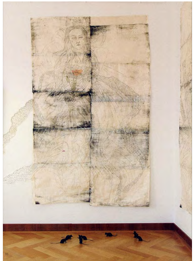
Figure 41 Floating

In contrast to the crumpled flesh of the dead, there are also large, waif-like floating female figures, so light they almost seem to breathe, “their long dresses fluttering and glinting across the walls...” with lacy vaporous trails wafting around them, their paper eyelids and long paper lashes, flickering between open and closed. (Hentschel) “Somewhere between life, death and dream, these liminal figures seem to take the place of the spirit birds perched throughout the installation, bringing the themes of Annunciation and inspiration full circle, as these spirits now depart.” (Hentschel) As we finally summon the courage to step up to the