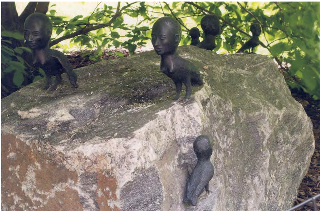
Figure 7 Siren

Kiki Smith's vision and work as an artist exemplify the struggle to give the body its due while continually transgressing this artificial boundary, breaching this invisible membrane and allowing the eros of body and spirit to flow into one another again, to reunite. She says, "...In working with the body, I feel I'm actually making physical manifestations of psychic and spiritual dilemmas..." (Posner, p. 32) She suspects that Catholicism and art have gone well together because "both believe in the physical manifestation of the spiritual world, that it's through the physical world that you have spiritual life, that you have to be here physically in a body... And it's about transcendence and transmigration, something moving always from one state to another." (Art 21 video, I.S. #4)