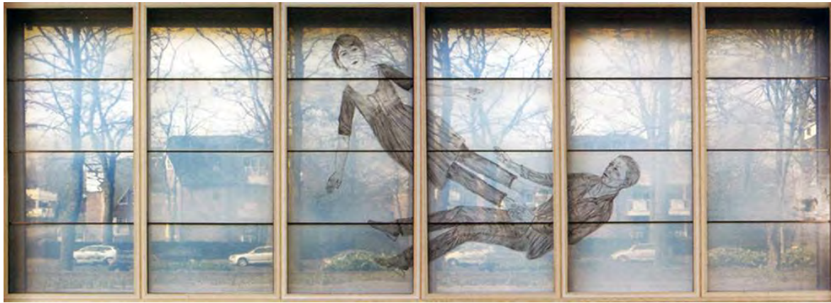
Figure 34 Window

In this magnificent painting on glass, floating as in a dream, an older woman is birthing and sending off her younger alter ego, who both precedes and follows her, just as someone will send her daughter away from home when she decides to venture out into her own life – also suggesting the destiny of an artwork in its moment of creation as well as when it is sent off into the world. The daughter emerges from the body of the mother like a spirit – pointing also to the pos-