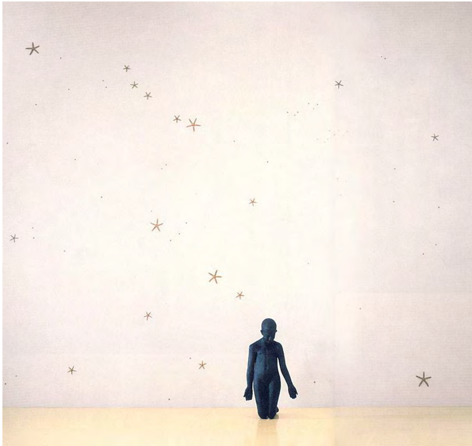
Figure 13 Blue girl

stands for something not clearly known and yet profoundly alive". (1933, p. 170) According to philosopher Suzanne Langer, artistic forms are more complex than any other symbolic forms we know..." (Langer, p. 25) "Significant form" or "expressive form", she adds, "is not an abstracted structure, but an apparition and the vital processes of sense and emotion that a good work of art expresses seem to the beholder to be directly contained in it - not symbolized but really present." (ibid., p. 26)