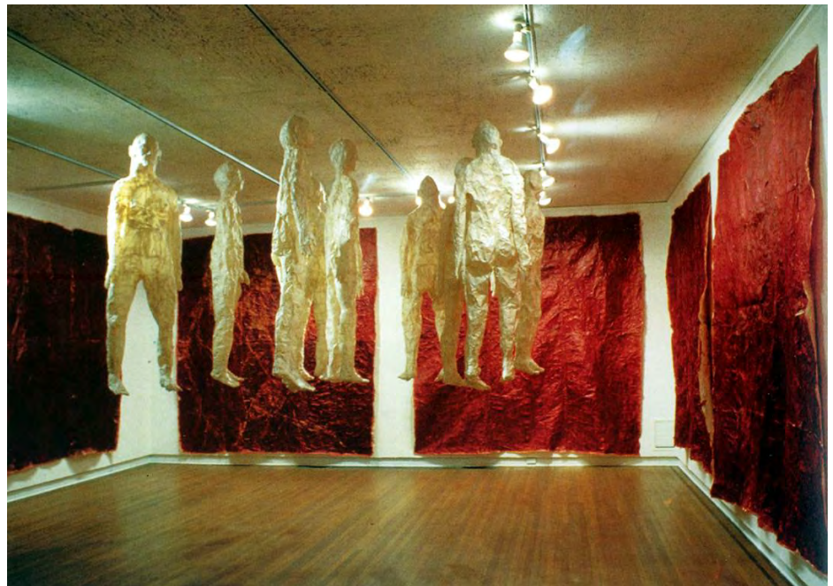
Figure 14 Paper bodies

meaning... “because they have no weight to them – they’re translucent and fragile – [and] have [a] quality of transcendence.” (ibid.)