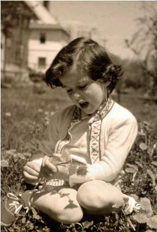
Figure 1 Kiki Smith

My ongoing inquiry into the nature of creative process has led me to focus, in this paper, on the metaphor of the body as clothing, vessel and ground for the manifestation of spirit and, conversely, on the body's agency in longing for and seeking to bring to life its own hidden, inner spirit. The work of Kiki Smith, one of the most intuitive and influential artists of her generation, draws the spirit deeply into a bodily feminine narrative on a number of levels, through media, method, style and content. Her intensive process transfigures this convergence of embodied spirit and inspirited body into an extraordinary array of symbolic forms, exemplifying a singularly feminine mode of creation.