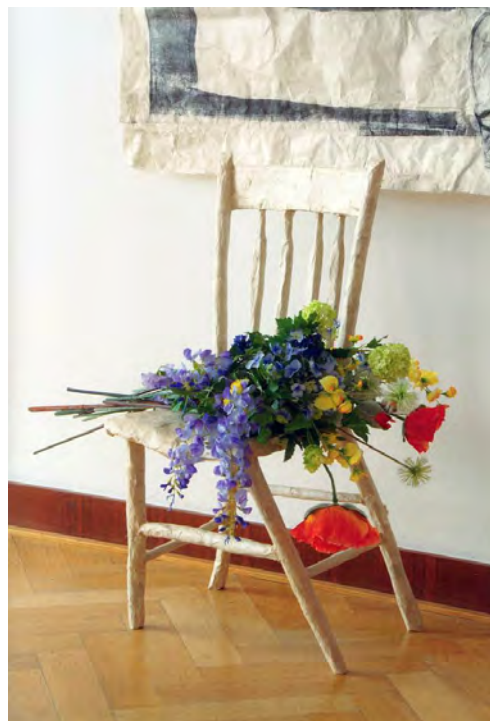
Figure 40 Flower chair

for our viewing. We find ourselves at a kind of wake, with papier-mache chairs set about the room, some empty, some holding flowers or a crafted quilt, and a feeling of suspended animation pervades.