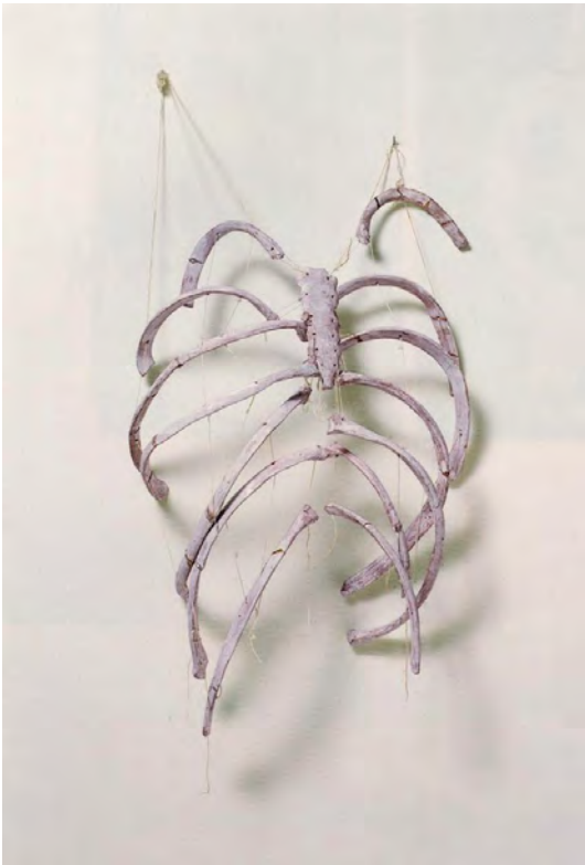
Figure 10 Rib cage

evokes the vulnerability as well as the strength of the body. Smith considers this piece the beginning of her work and the origin of her artistic identity, sprung like Eve from Adam's rib. When she was criticized for making such frail and potentially ephemeral work, she defiantly determined to make the most vulnerable work she could, without apology, and to do so in an aggressive manner, employing humble materials and techniques disdained for their craft orientation, and subject matter reviled for its visceral femininity. (Posner, p. 14) As she put it, "something used against you can be an asset. I like employing my deficits." (Engberg, p. 39) Smith says that as an artist,