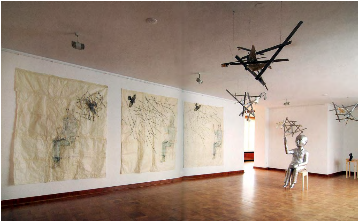
Figure 31 Annunciation and seated woman

woman, as she traces out on the paper a single branching line, perhaps another metaphor for life's twisting path. While somewhat stark, this image is not bleak – but contains a spirited full-bodiedness. The fabric of the woman's billowing skirt – seemingly indicating an abundance of life – is echoed the coverlet over the baby as well as the shroud behind the coffin and the curtains on the windows, so that the beginning and ending, rather than being linear, seem to go around in a continuous loop, the one fulfilling itself and starting over, circling around the central round table. Smith said she sees the empty chair in the picture as a projection of the beloved, or the imagined future life. This supposition is also suggested by the mysterious picture on the wall, depicting an ambiguous encounter. Punderson was very young when she made this needlepoint, and was later to marry and die in childbirth, a harsh reality contrasting with her young dreams of the future. (dossierjournal.com; Hentschel, p. 29)