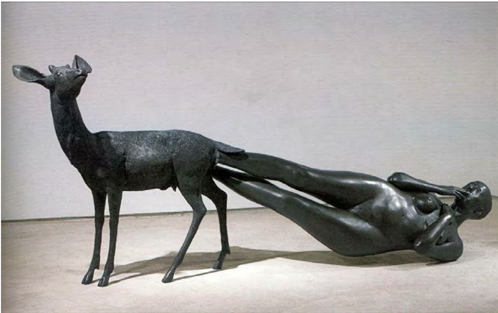
Figure 16 Born

bodying those gestures, you experience the world through that particular movement and it changes your relationship to your environment, and to yourself." (pbs.org)