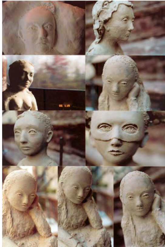
Figure 2,3 and 4 Images from Kiki Smith's "I myself have seen it" exhibition

Mary Oliver's poem, "The Spirit Likes to Dress Up", conveys the playful delight the spirit takes in intertwining with the body, as do these images from Kiki Smith's recent exhibit called "I myself have seen it", which brought together thousands of her photographs, many of them of her own works in progress as she engages with them before sending them out into the world.