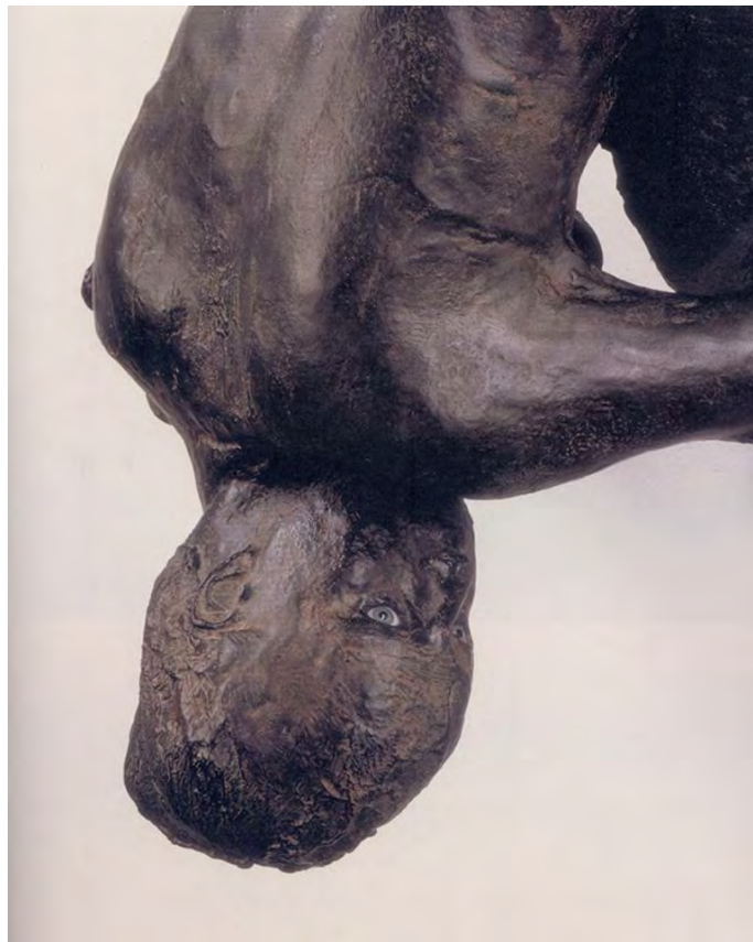
Figure 21 Lilith detail