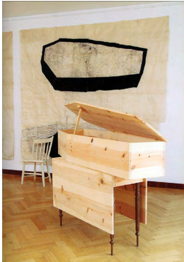
Figure 39 Coffin

for our viewing. We find ourselves at a kind of wake, with papier-mache chairs set about the room, some empty, some holding flowers or a crafted quilt, and a feeling of suspended animation pervades.