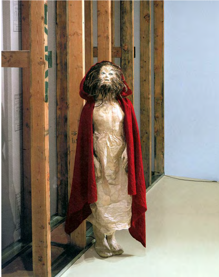
Figure 18 Daughter