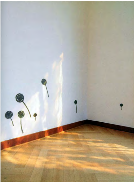
Figure 29 Dandelions

ments, creativity and inspiration are given to us freely” and “as an artist, one tries to imbue the next generation with a sense of possibility.” (youtube)