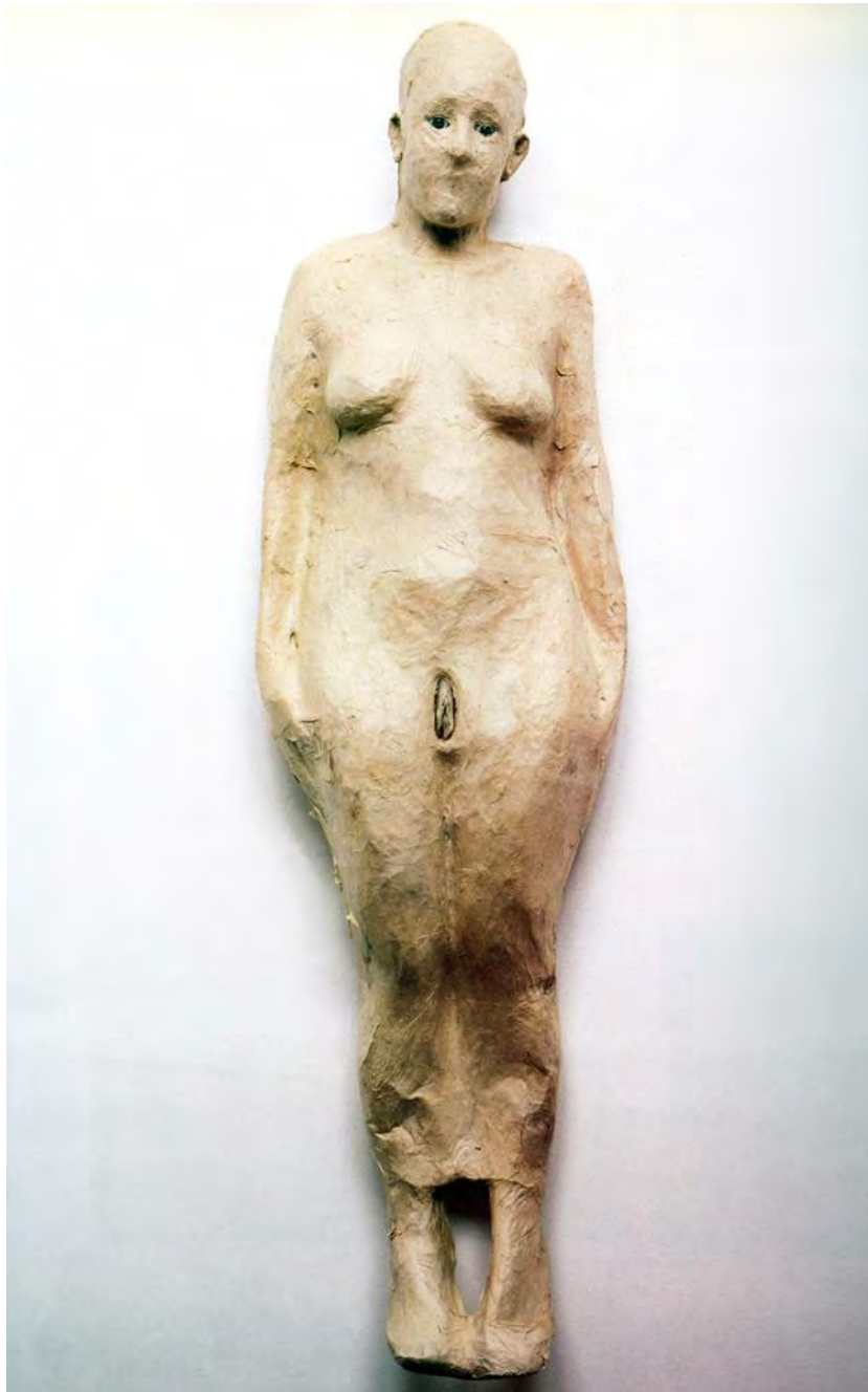
Figure 25 Virgin Mary