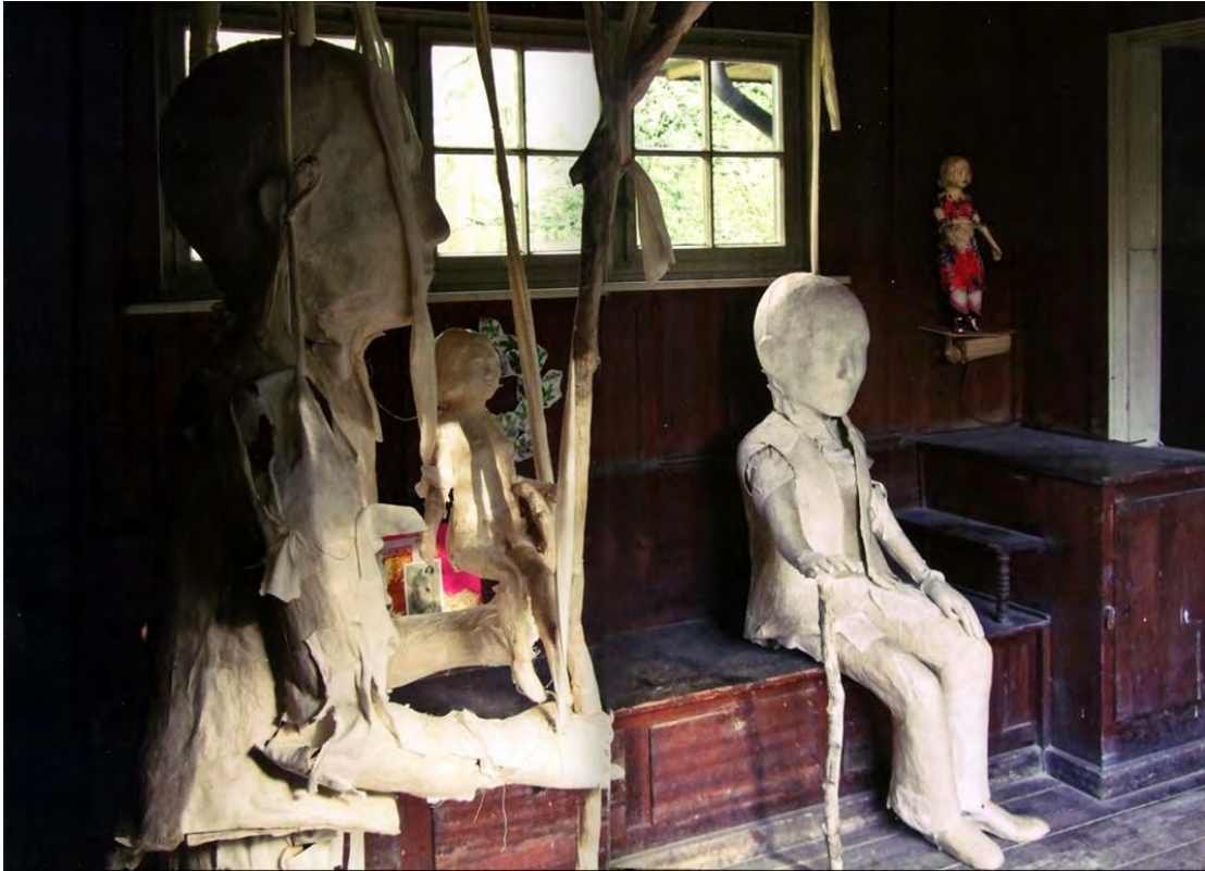
Figure 43 Pilgrim