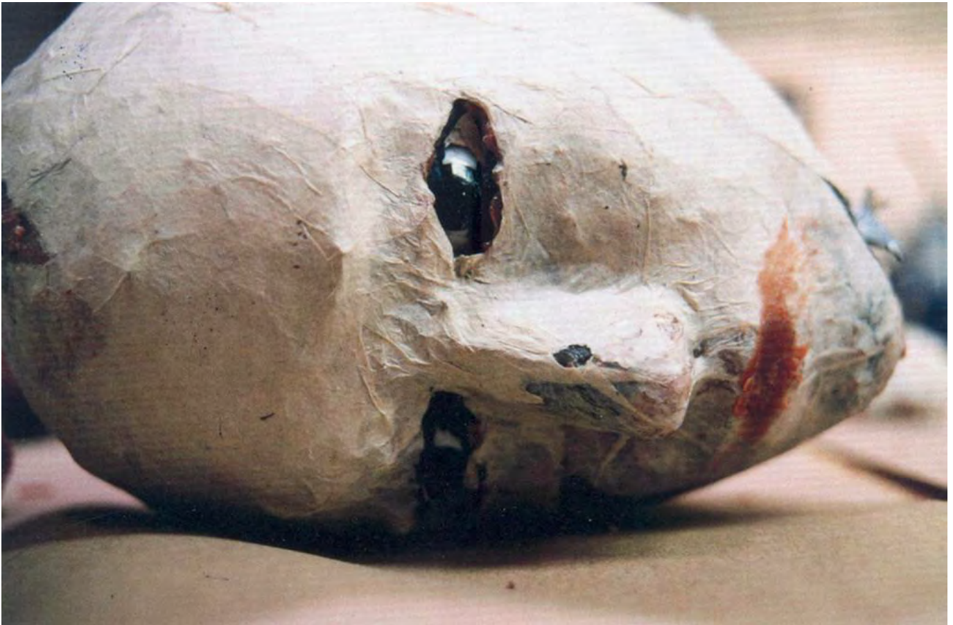
Figure 26 Kuan-yin