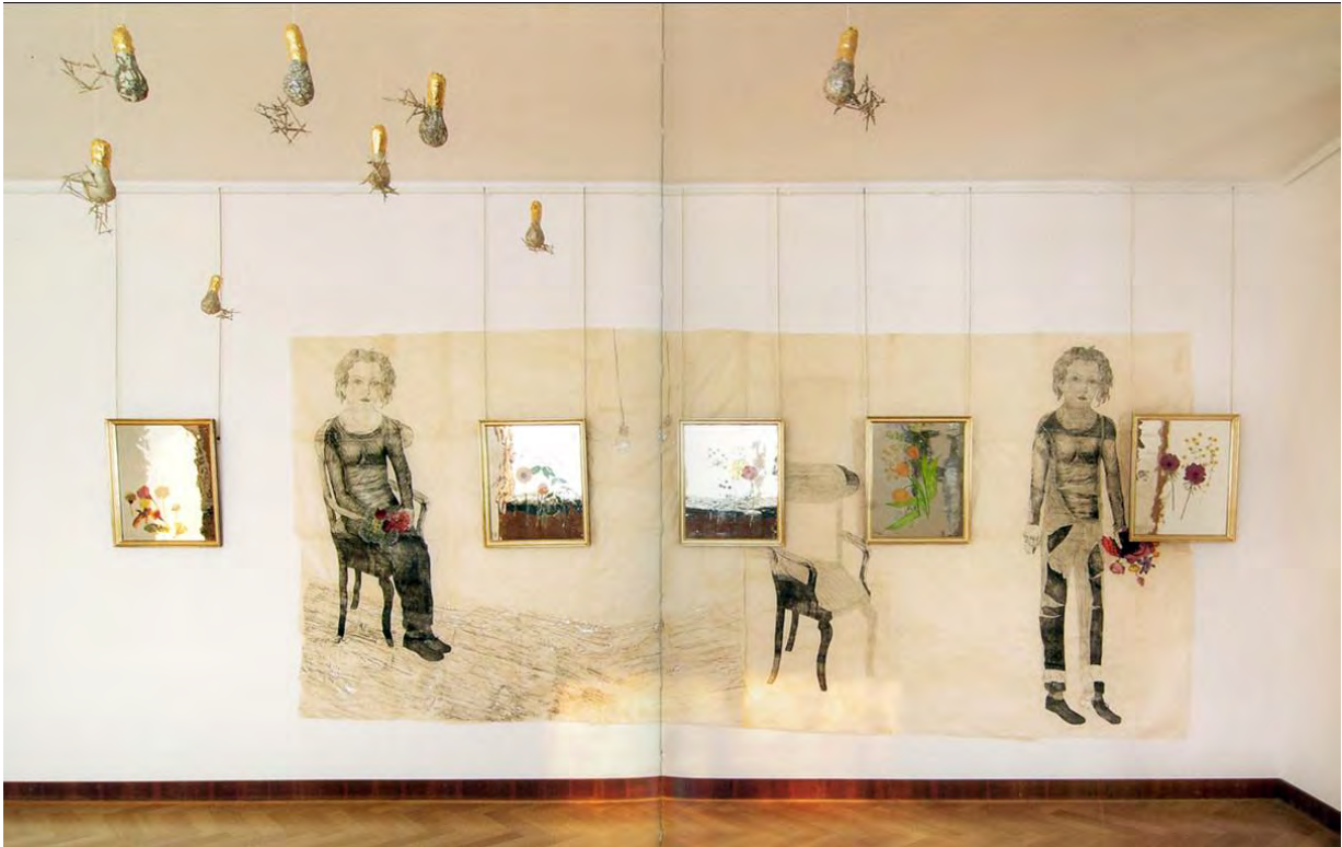
Figure 36 Large drawings/collage on Nepal paper and reverse paintings on glass

cariouly balanced, graceful position, as if the slightest breeze would topple her. She seems to have alit on this table's edge as spontaneously and fleetingly as the bird perched on her hand. This work's title, "Search", suggests life's erotic adventures and yearning for another, while the dove again suggests the eros and fulfillment in creative pursuits. (ibid., p. 26)