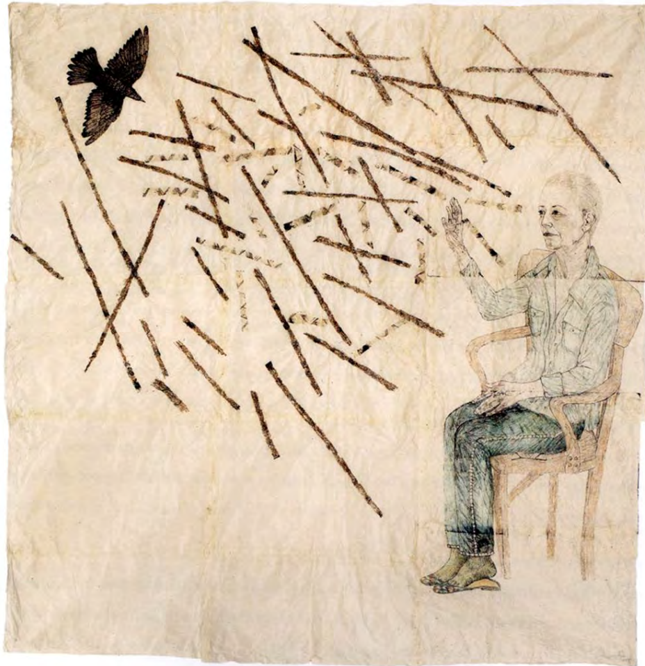
Visitation I by Kiki Smith

In order to best view this article's images, please download this PDF and open it in Acrobat Reader .