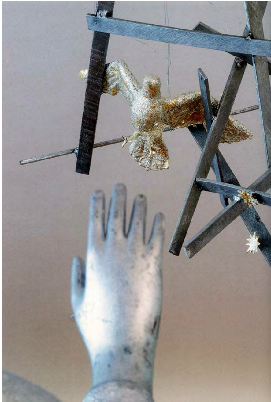
Figure 45 Annunciation (detail)

show up for it and use it. But in general it's like the messenger. It's like the holy ghost coming – you're just minding your own business and then things appear to you or become evident to you...I trust my work. It's a collaboration with the material, and when it's viewed, it's a collaboration with the world." (Pbs.org)