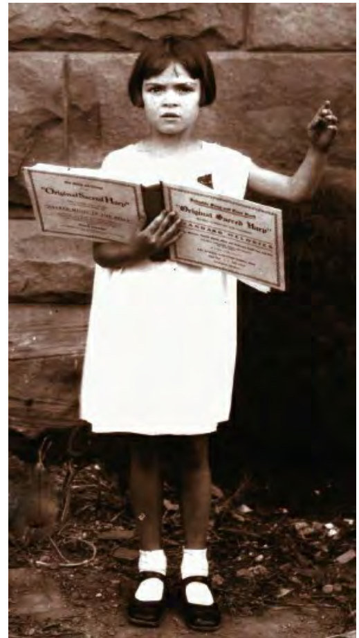
Figure 38 Young harp singer

As we step through the doorway into the final room, a hush seems to fall, as the room is filled with images of death, drawings of corpses on deathbeds and in coffins. In the middle of the room we find a turned-leg table holding a simple wooden coffin, a perfect embodiment of the one in the Punderson needlepoint, but this one is propped open