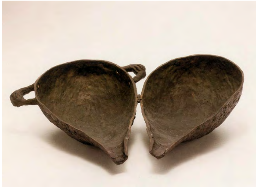
Figure 9 Uterus

Through exploring the depths of her visceral bodily experience of being a woman in the world at each particular moment, and laboring to find expression for it, Smith shapes it into meaningful symbolic form, which creates a containing vessel for this experience. Concerned with the fragmentation and dualism that pervade our individual bodies and