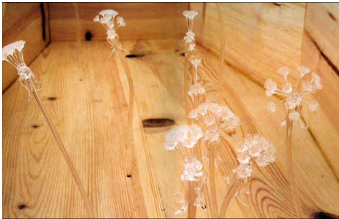
Figure 42 Dandelions

wooden coffin and peep inside, we are amazed to find breathtakingly delicate blown glass dandelions. In this last room, there’s a feeling of a long slow passage into death, a transformation, but not a total separation – as the dandelions evoke a sense of new life beginning and carrying on as the souls of the dead depart. Smith