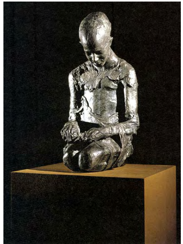
Figure 11 Bandage girl

She says, "our bodies have been broken apart bit by bit and need a lot of healing; our whole society is very fragmented – everything is split and presented in dichotomies – male/female, body/ mind – and those splits need mending" (Posner, p. 13) She maintains that all that is associated with the feminine, such as nature, the body, and the natural spirit, is constantly devalued. "If you're a female artist" she asserts, "you're already marginal, on a discard pile, so you can use things or situations that are discarded, that are sort of free, and that aren't associated with power." (Posner, p. 34) This calls up the alchemical notion of the lapis