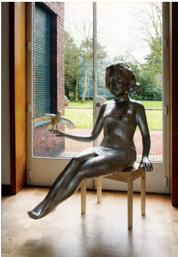
Figure 35 Search

In this magnificent painting on glass, floating as in a dream, an older woman is birthing and sending off her younger alter ego, who both precedes and follows her, just as someone will send her daughter away from home when she decides to venture out into her own life – also suggesting the destiny of an artwork in its moment of creation as well as when it is sent off into the world. The daughter emerges from the body of the mother like a spirit – pointing also to the pos-