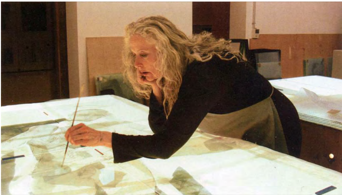
Figure 8 Kiki Smith at light table

These conflicting ideas and definitions of body and spirit bring us to the question of the purpose of art – and its role in bringing spirit and body together in making meaning – enlivening the body through activities that lead to representations of life beyond the body, which also