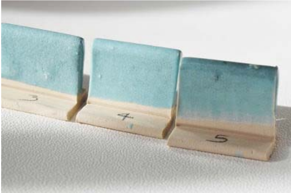
Figure 7 “A successful glaze test getting just the right shade of turquoise and just the right surface texture. It’s a line blend of stains and copper oxide. Since you ask, the best one is No. 4.” (Marshall Colman)

Anyone can dream up images but to make meaning from those images requires the active hard work of the symbolic (“transcendent”) function. As my title implies, for me, act and image are deeply intertwined and ultimately inseparable. After the labours of The Red Book , from the robust dialogue with his fantasies to the detailed work of transcribing them, I have little doubt that Jung would agree with me here.