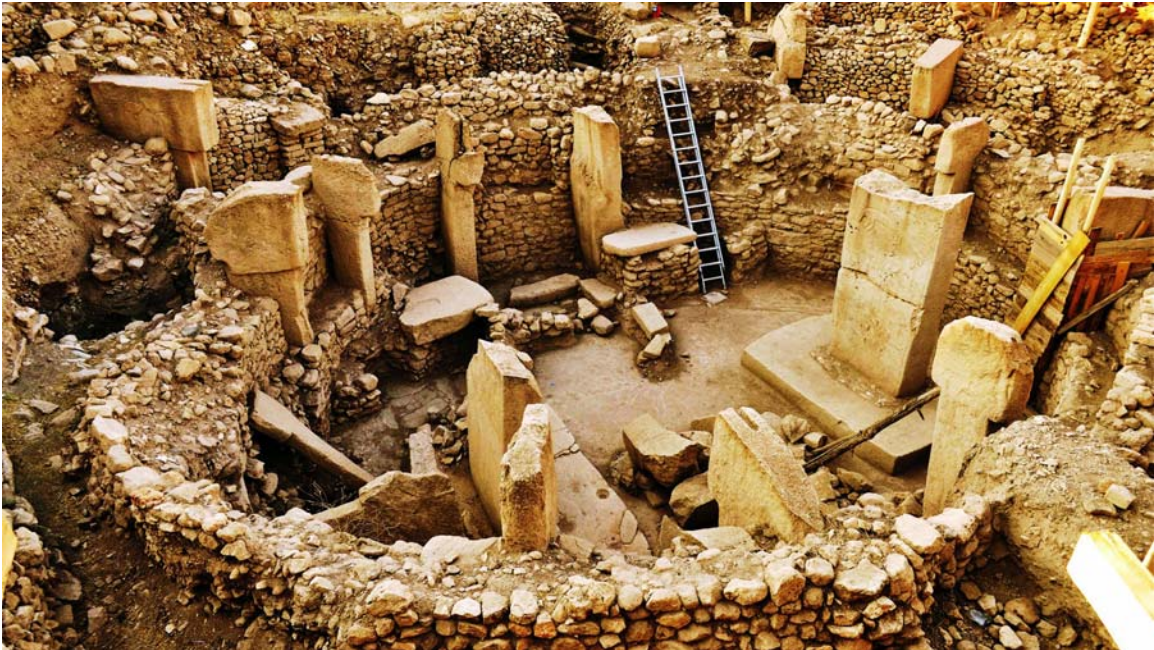
Figure 8 Gobleki Tepi, an archaeological site in modern Turkey associated with the time and place where agriculture began around 9,000 BCE. Whether the large gatherings of people around this monumental site were cause or effect of the domestication of wild cereals is not clear.

seems to be due to a refusal to consider any other possibility than a self-generating autonomous and unconditioned psyche as the source of all ideas and images. Given his claim that 'From Jung's perspective, any idea enters social realm from individual psyche', I wonder, how he might explain something like the idea of agriculture that initiated the Neolithic era 10,000 years ago?