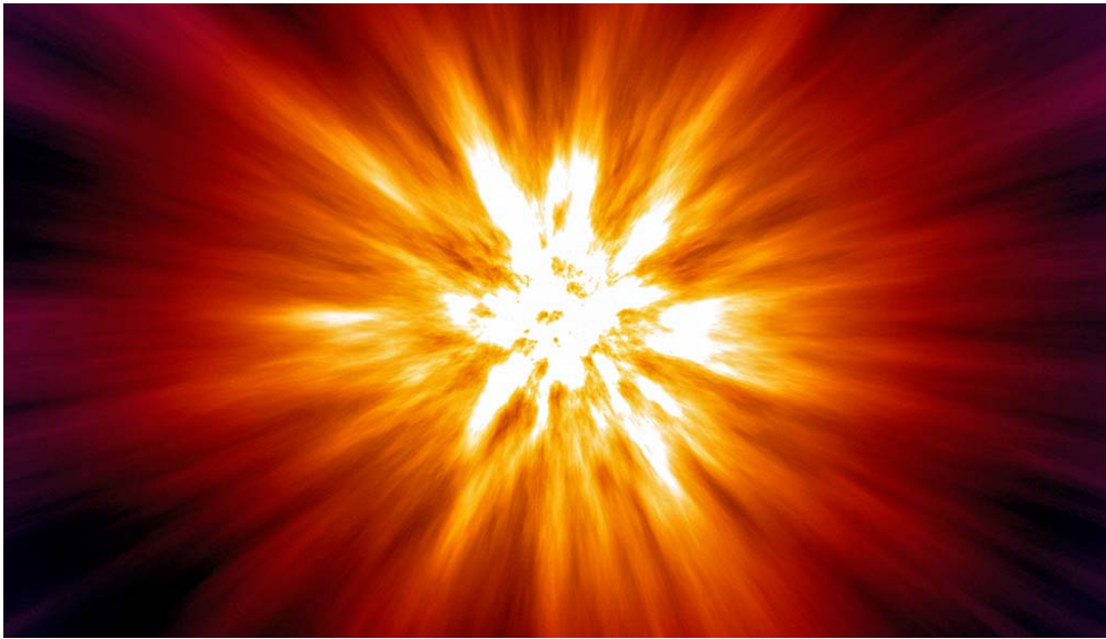
Figure 2 Conceptual computer artwork representing the origin of the universe.

insofar as it makes no sense to ask what was ‘before’ the beginning – or so I understand from the mathematicians.