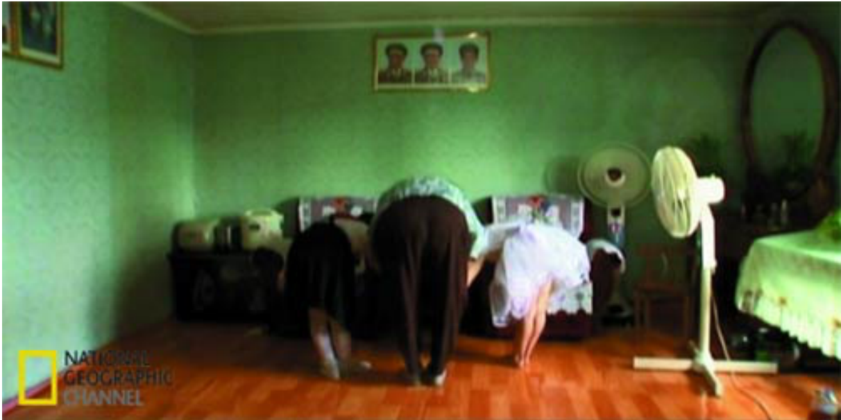
Image 6 A picture of North Korean family in the worshiping ceremony for Kim family.

Meanwhile, extreme conservatives in South Korea and America mock North Korea for its insanity or become infuriated by its abuse of human rights. It is part of human nature to want to help the oppressed, but we may become hypocrites by projecting our own insanities onto North Korea without reflection on our own flaws and limitations. Hasty intervention often does not guarantee real improvements, and instead creates unnecessary tension among societies. For example, South Korean prisons do not provide beds for inmates and hot water is only given once a week for 20 minutes, regardless of the weather. Developed countries are still struggling with social injustices such as racism and unfair legal proceedings against minorities and poor people. Between 2007 and 2012, an estimated 630,000 people per year have experienced homelessness in America. 8 More than 11,340 homeless people were reported in Korea as of 2016. 9 Interestingly, South Koreans tend to consider