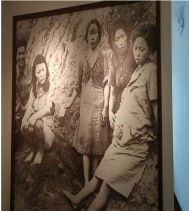
Image 3 Pictures of comfort women. nocutnews.co.kr 2014, Jan.17