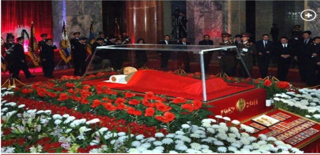
The body of North Korean leader Kim Jong Il lies in state at the Kumsusan Memorial Palace in Pyongyang.

Image 7 Mummified Kim Kong's body.