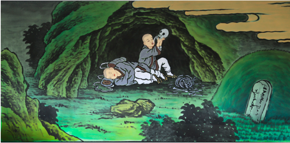
Image 8 In a folk art, Wonhyo is portrayed as a monk who is drinking polluted water contained in skeleton. At night in a dark cave, he drank water for thirsty and was satisfied with good taste in decent bowl. In next morning, he found that it was in skeleton and became enlightened that everything was up to one's mind and illusion. Since then, he wrote many scriptures, gave great sermons, but stayed within common people's community. He danced, ate, slept and played with anybody with open-minded attitude.