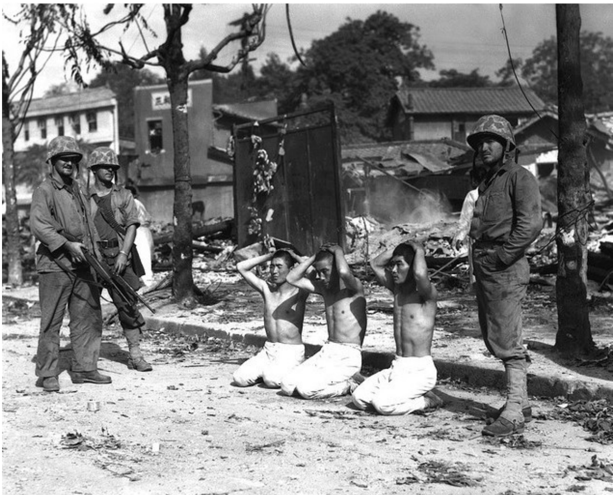
Image 5 Picture of American soldiers and Korean civilians.

In 1945, liberated Korea was divided in half by the victors of WWII. The Soviet Union occupied the North and UN and US forces occupied the South. The division of the Korean peninsula by the superpowers confused and rendered the Koreans powerless. Even before the Korean War broke out, the United States occupation of the South was seen as an invasion by the North Koreans and the Soviet Union occupation of the North was seen as an invasion by the South Koreans.