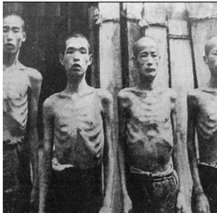
Image 4 Pictures of forced laborers in Japanese mine.